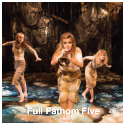
Full Fathom Five

Also did scenic painting to mimic a concrete floor, pebbledash and graffiti.